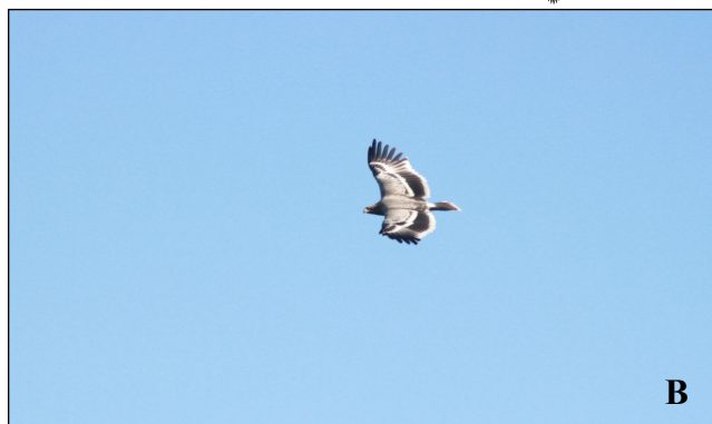
Photo 3. Juvenile Steppe Eagle from below (A) and above (B). 7.01.2013.

Фото 3. Молодой степной орел сверху (A) и снизу (B).