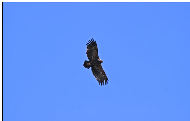
Photo 2. Sub-adult Steppe Eagle. 30.11.2012.

Фото 1. Неполовозрелый и молодой степные орлы, сидящие на сосне.